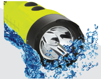
Durable polymer body is impact & chemical resistant